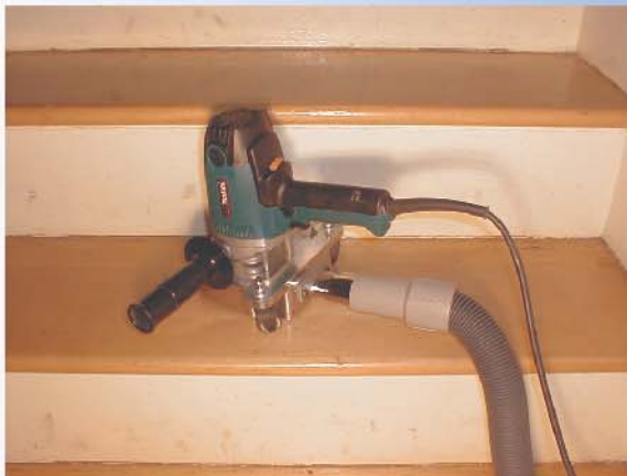
Only edger designed for stairs and small places